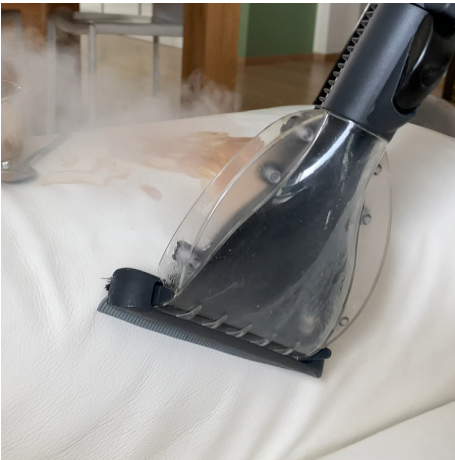
Upholstery refreshed in minutes: stains gone, colors revived, ready to use!