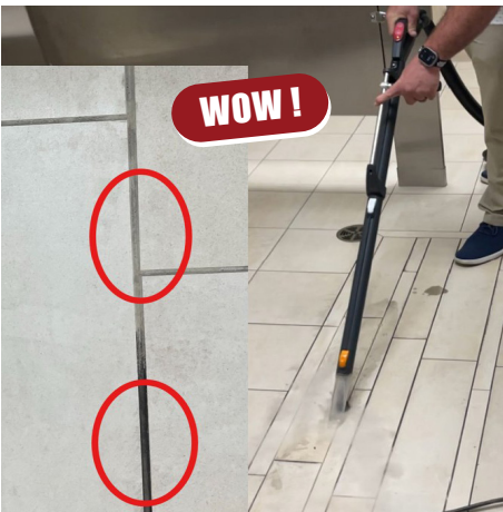
Clean and renewed grout lines done effortlessly!