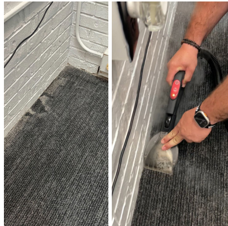
Carpet stains removed with dry steam: no residue, no damage, no reappearing spots!