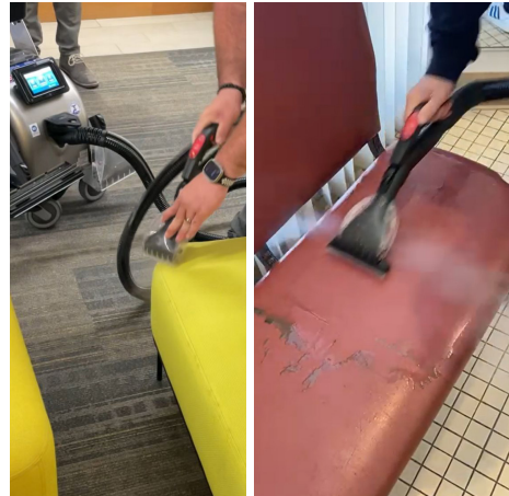
Waiting areas kept truly clean: seating and handrails sanitized in every corner!