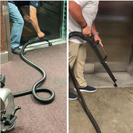
Elevators cleaned top to bottom: steam kills germs on buttons, floors, and walls!