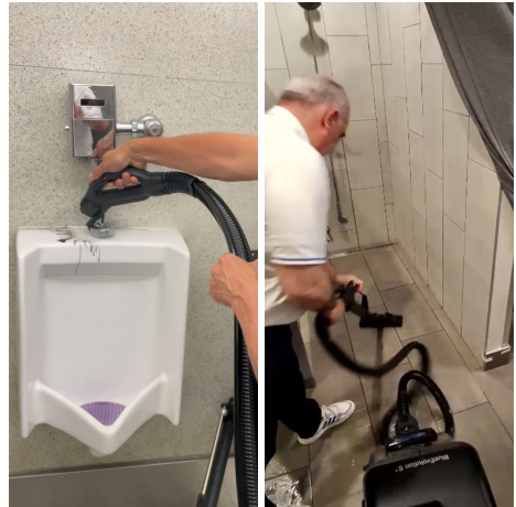
Seats, bowls and buttons—cleaned without touching the surface.