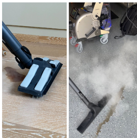
Safe deep cleaning for wood and vinyl surfaces.