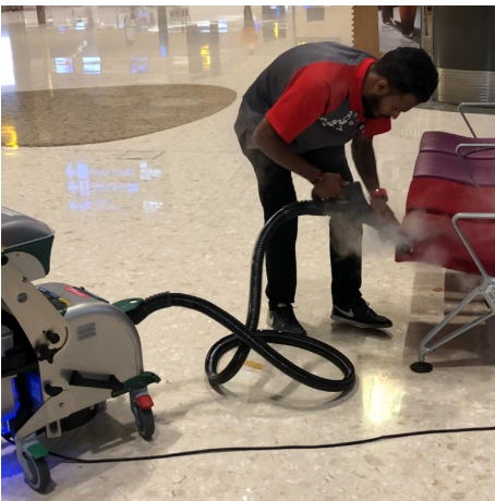
Desks, tables, chairs cleaned faster: one system, zero chemicals, better hygiene!