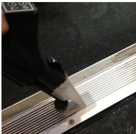
Dirt and grease gone in minutes: floors dry, safe and clean again!