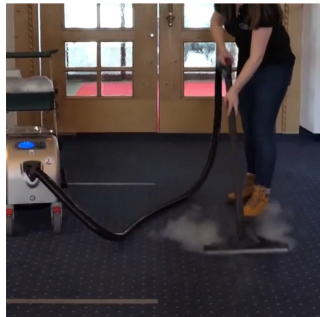
Steam-powered carpet cleaning: deep hygiene with no chemical residues left behind.