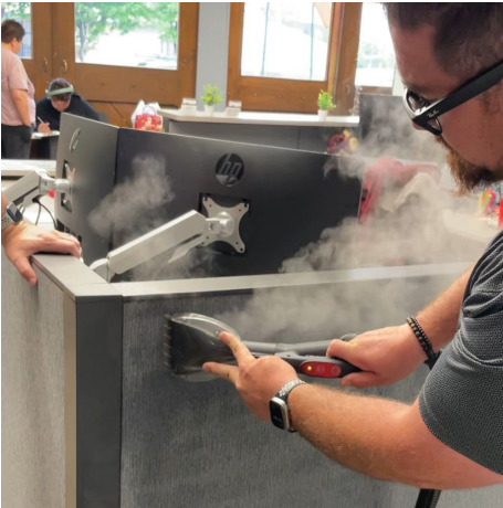
Surfaces and edges sanitized in seconds: no grime left behind, 99.9% of germs gone!