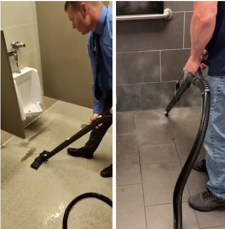
From dirty grout to hygienic floors: the steam dissolves the dirt and the vacuum quickly removes it, leaving the surface clean and dry!