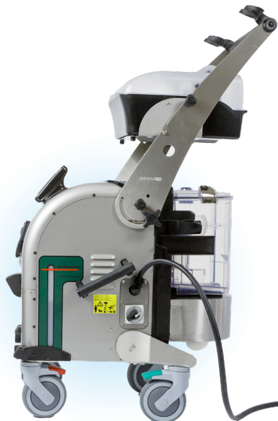
Model XL +