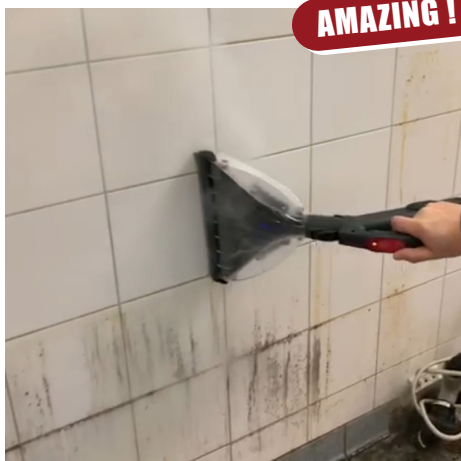
Kitchen walls without streaks. Steam, sanitize and vacuum with zero cross-contamination.