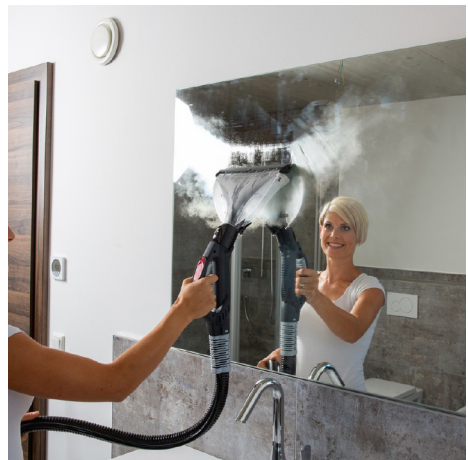
Fingerprints gone, no more streaks: mirrors cleaned in one pass, dry and spotless!