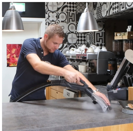
From sticky to sanitized: tables and countertops cleaned fast with steam!