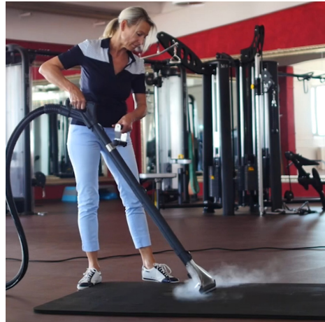
Office gyms sanitized easily : floors and gear cleaned with no chemical residue!